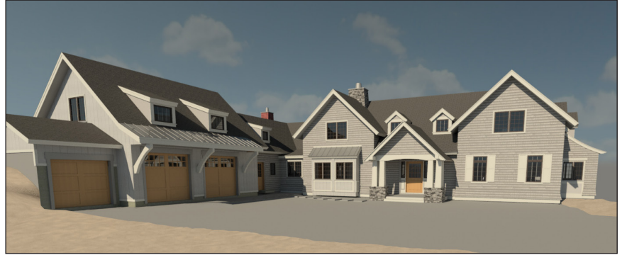
COURTYARD AND ENTRY

Materials include timber framed entry and awning, cedar shake and painted clapboard siding, stone and salvaged brick chimneys, and standing seam roofing.